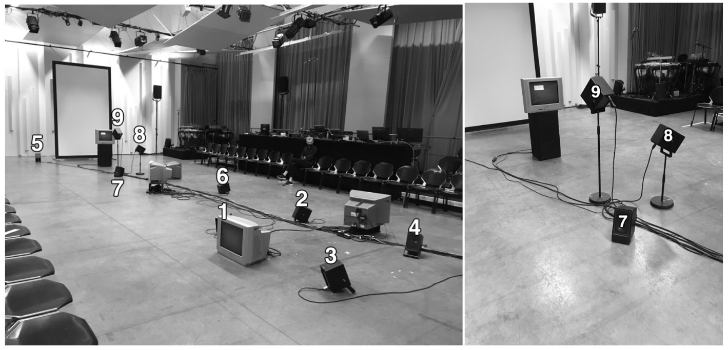
If the 4 speakers version is played, just keep the first four around the viola.

Televisions can be freely placed in the hall. Ideally, every member of the audience should be able to see at least 2 or 3 of them. If CRT TVs are unavailable, small lo-fi screen might be used instead.